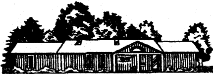
A Community Treasure Pavilion Public Library